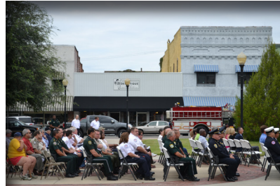
9/11 Guests at the 9/11 Memorial Service in the square.

Lake City remembered the fallen heroes in a 9/11 Memorial Service held in the square. Lifeguard Ambulance Service showed respect as well by having four ambulances and ten employees in attendance to pay tribute to the men and women who lost their lives on that tragic day ten years ago.