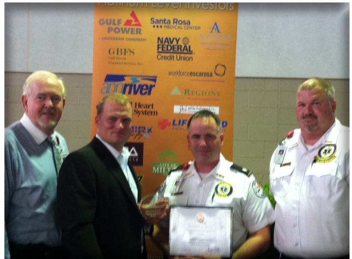
Picture of Lifeguard’s Representatives at the Luncheon (left to right):

Lifeguard attended TEAM Santa Rosa’s Industry Appreciation Luncheon on September 21st. The appreciation luncheon gave TEAM Santa Rosa the opportunity to highlight companies that continue to increase the amount of jobs in Santa Rosa County. Lifeguard received an “Industry Expansion” award for creating 50 more jobs in the first nine months of 2011.