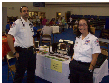
Above: SRC Health Expo Below: God & Country Rally